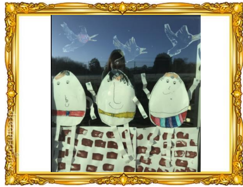
Amazing work from the children in Class 2, who have worked very hard to create their own Humpty Dumpty! They are fantastic!