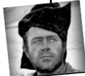
Robert Falcon Scott