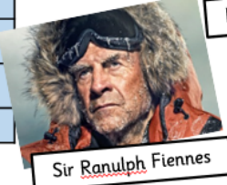
Sir Ranulph Fiennes