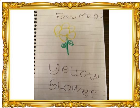
Well done to Emma P in Class 1, we love the yellow flower you have drawn for the phoneme 'y'! Keep up the hard work!