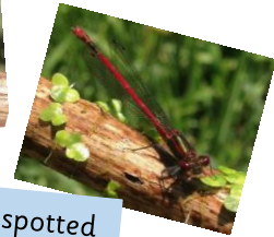
Damselflies that I spotted near my pond.