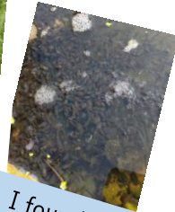
I found some!!