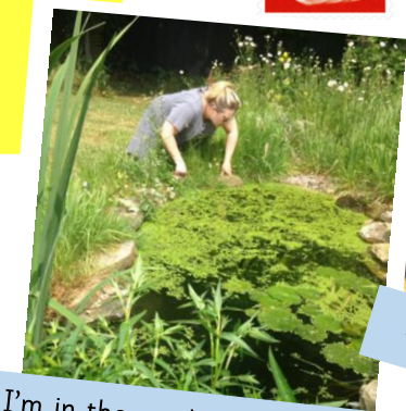
I'm in the garden at the pond looking for tadpoles.