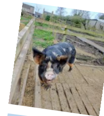
Here are some of the animals I visited on my walks.