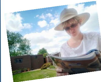
Enjoying reading in my garden in the sunshine.