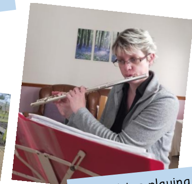
Practising playing my flute.