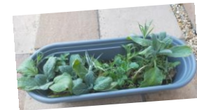
Here are our seeds. Fingers crossed for flowers soon!