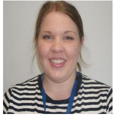
Mrs Bee's Challenge