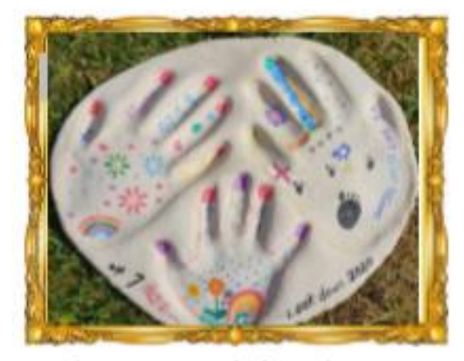
Amazing work from Lexi in Class 7, we love your beautifully decorated salt dough hand cast.