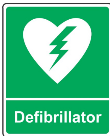
Figure 4: The UK standard sign for AEDs

All cabinets and wall brackets should be clearly marked using a standard sign for AEDs. The design recommended by the Resuscitation Council (UK) needs to be finalised. sentence from the footnote.ing a standard sign for AEDs. The design recommended by the Resuscitat is shown below. 8 Some suppliers may provide this as part of the AED purchase.